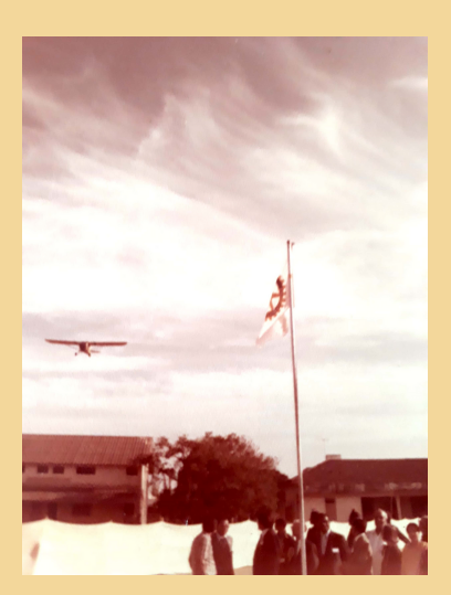
Flower showered from Puspak plane on RI Representative during the ianugration

A unique demonstration of polio vaccine was done, when Roundtowner brought an Auto Rixa on dais and presented a play on polio vaccine.